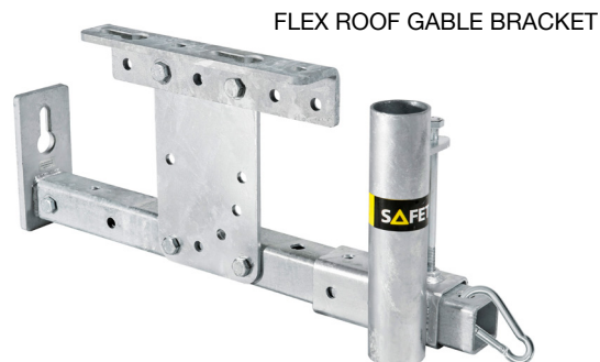
FLEX ROOF GABLE BRACKET