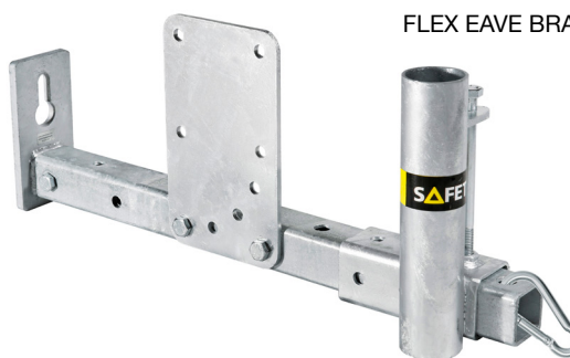
FLEX EAVE BRACKET